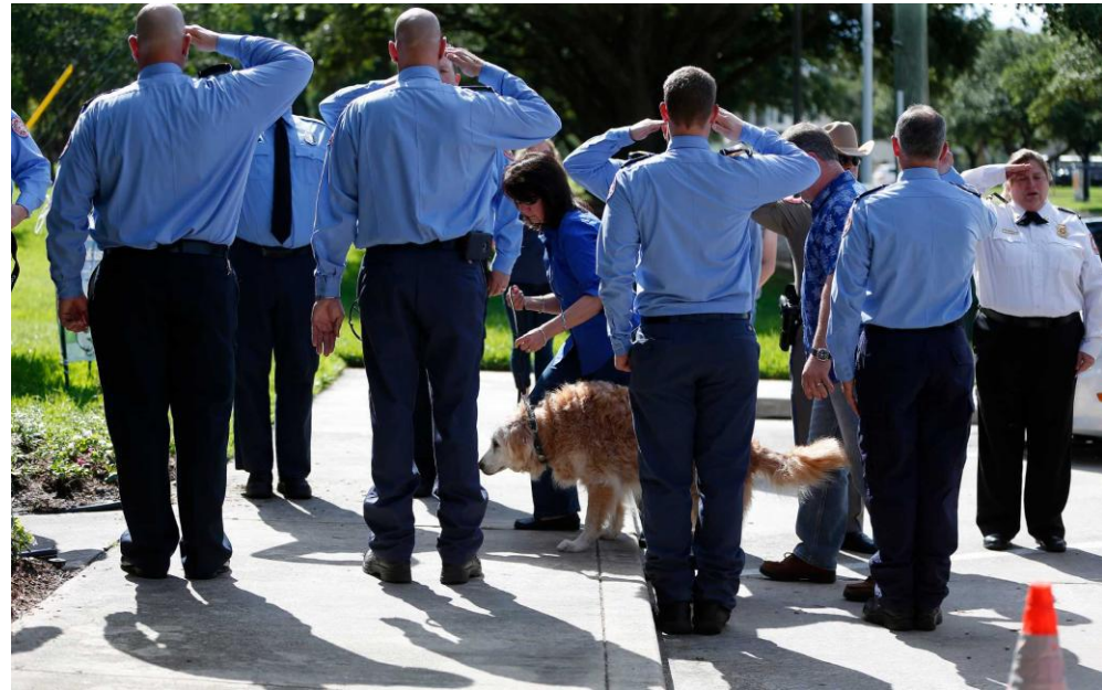
Incidents Involving Animals