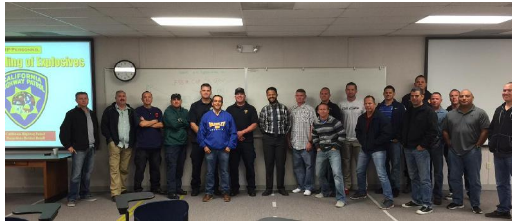
Incidents Involving Animals