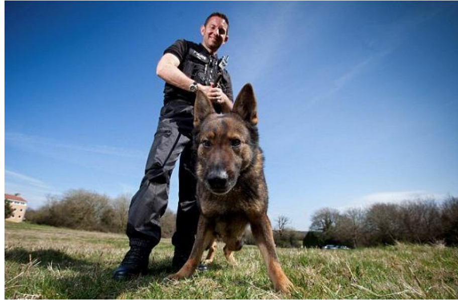
Incidents Involving Animals